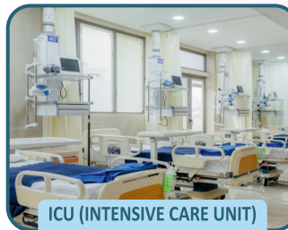
ICU (INTENSIVE CARE UNIT)