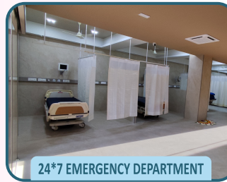
24*7 EMERGENCY DEPARTMENT