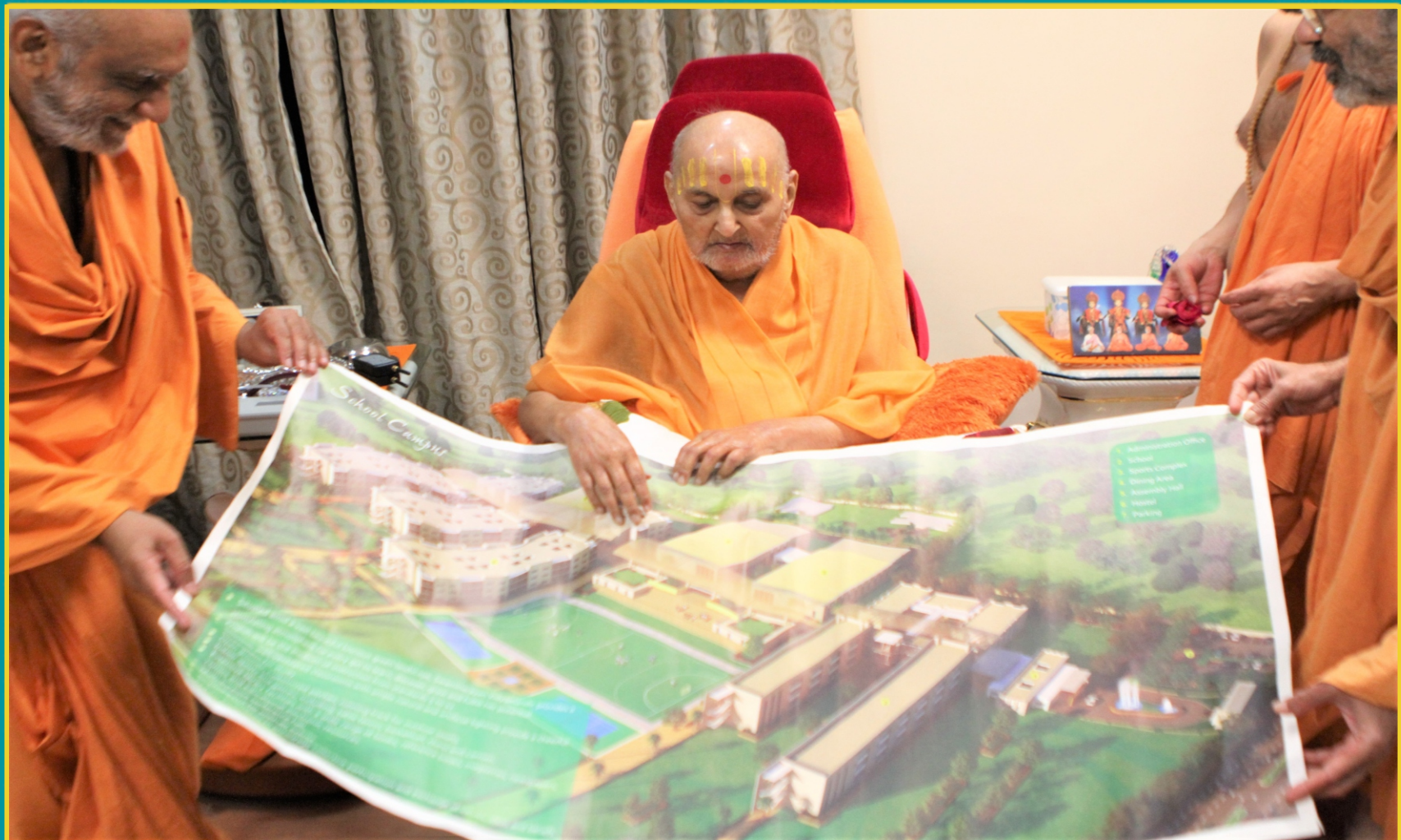
CAMPUS BLESSED AND SANCTIFIED BY BRAHMSWARUP PRAMUKHSWAMI MAHARAJ & PRAGAT BRAHMSWARUP MAHANTSWAMI MAHARAJ