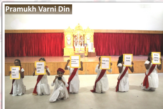
Pramukh Varni Din