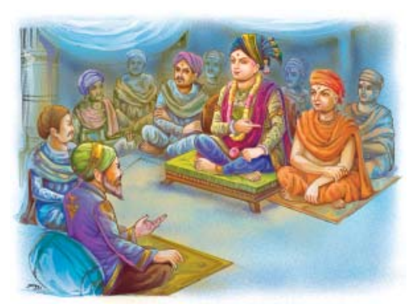
"This Sadhu is like me. I will keep him here as the mahant."