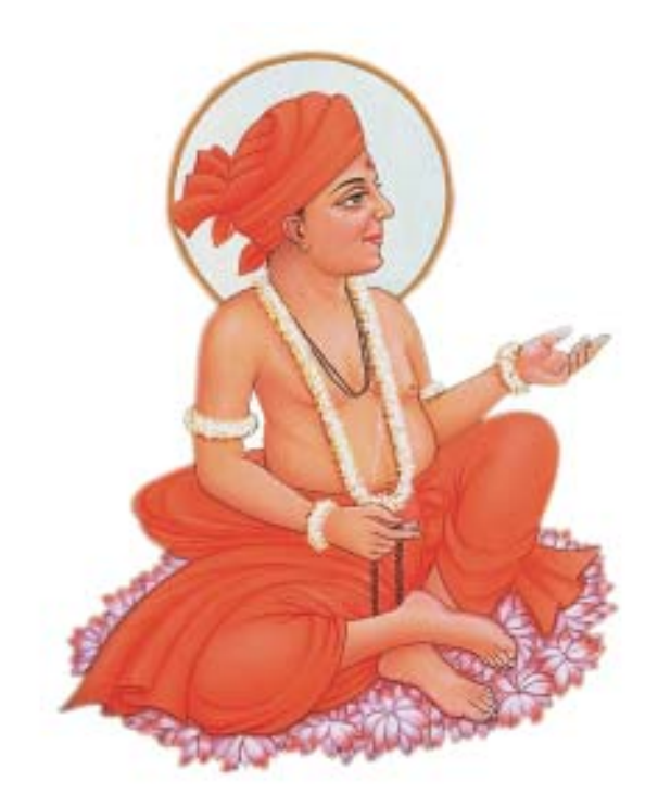
Aksharbrahma Gunatitanand Swami