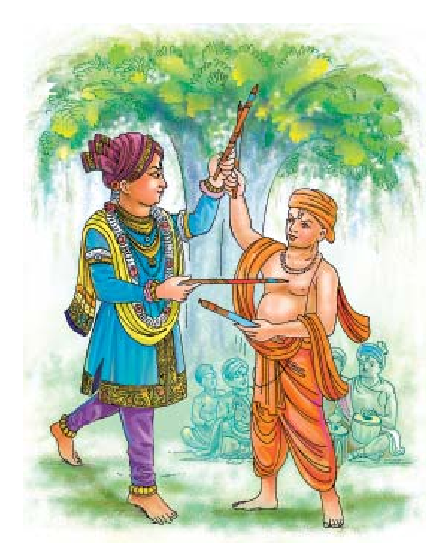
Shriji Maharaj reveals the glory of Gunatitanand Swami as the Sadguru