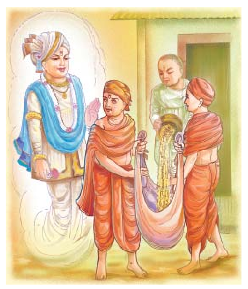
"How can I show my back to a sadhu like you?"

Once, while they were collecting alms, Anand Swami also witnessed Swami's constant focus on the